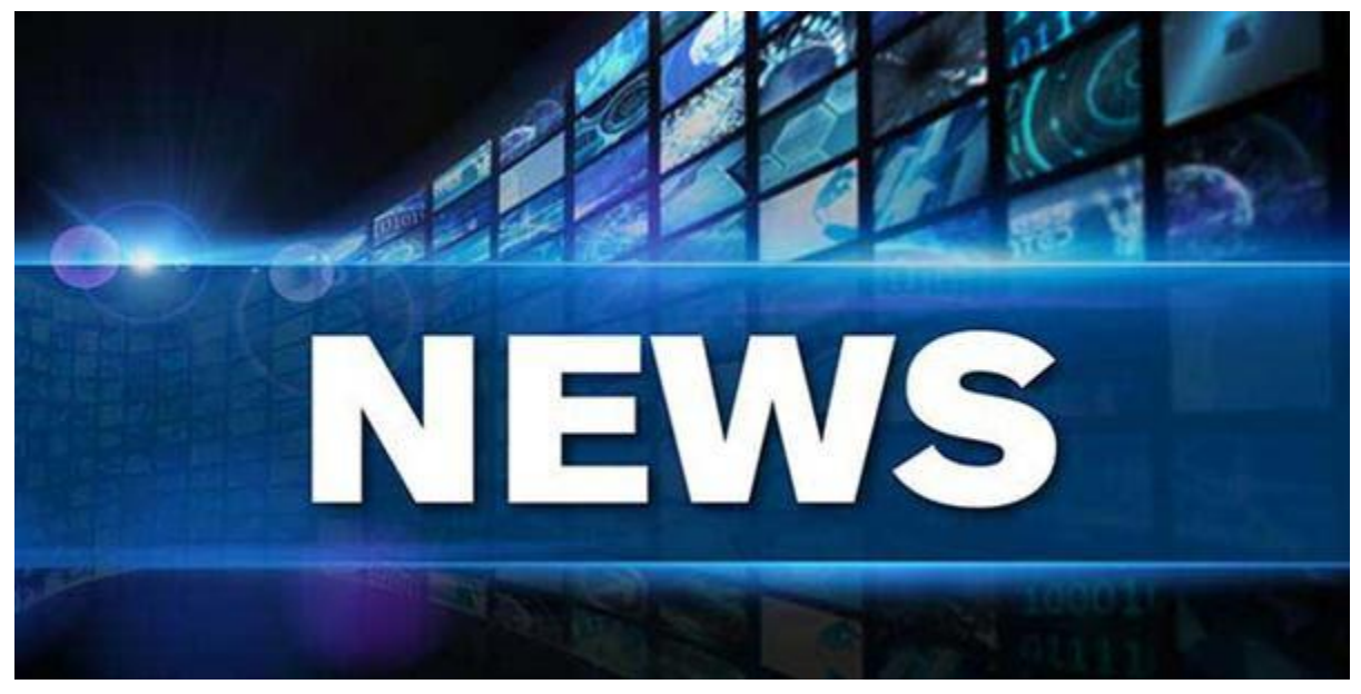
Man arrested following 50 mile police chase pursuit across Sussex

A man has been arrested following a police pursuit of around 50 miles in Brighton and West Sussex.